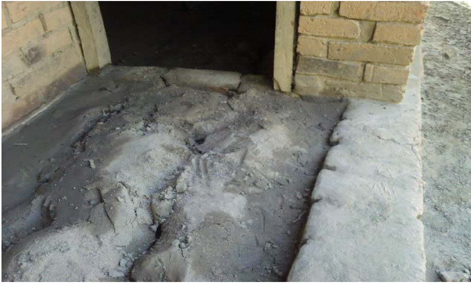
The secretion of a lava-like substance from a house affected by the earth tremors

MRCS intends to support those affected by the tremors through the provision of temporary shelter, which will include shelter kit materials, tarpaulins, basic household cooking utensils (where necessary) and poles for construction. MRCS would also like to continue providing awareness messages to the district and surrounding communities.