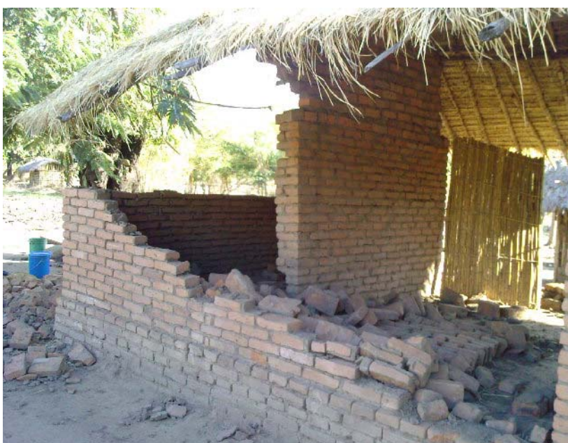
A house in Karonga district collapsed during the earth tremors

As an initial response, MRCS has given assistance to people left homeless by the earthquake, who is currently living in the open outside their damaged homes, which are in danger of further collapse. MRCS distributed 40 tarpaulins, five family tents and 20 shelter kits. IFRC has also despatched 400 tarpaulins and 300 shelter kits for distribution to the affected households.