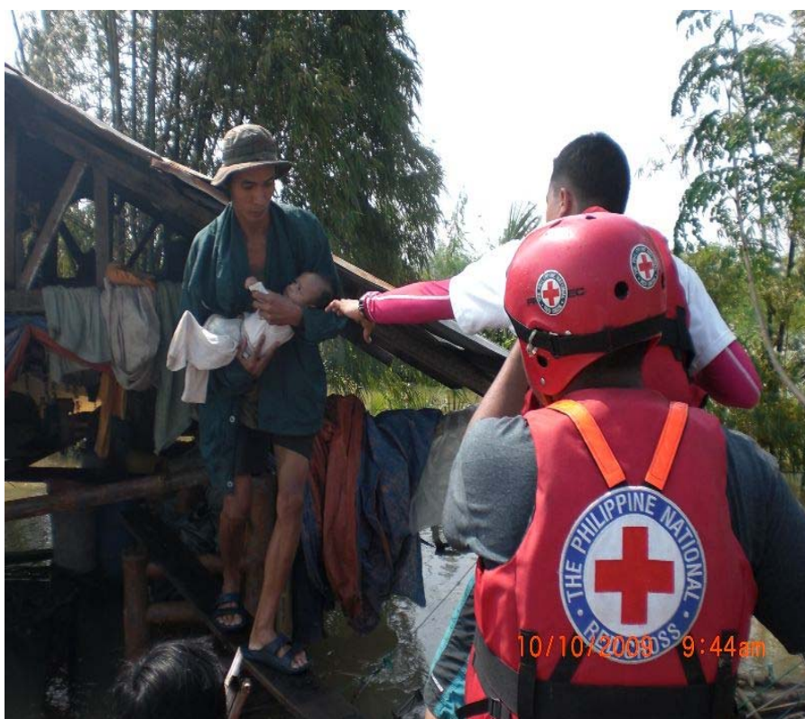
Philippine National Red Cross search and rescue team evacuates a family from their home in Pangasinan following typhoon Parma.

<click here to link to updated donor response list, or here for contact details>