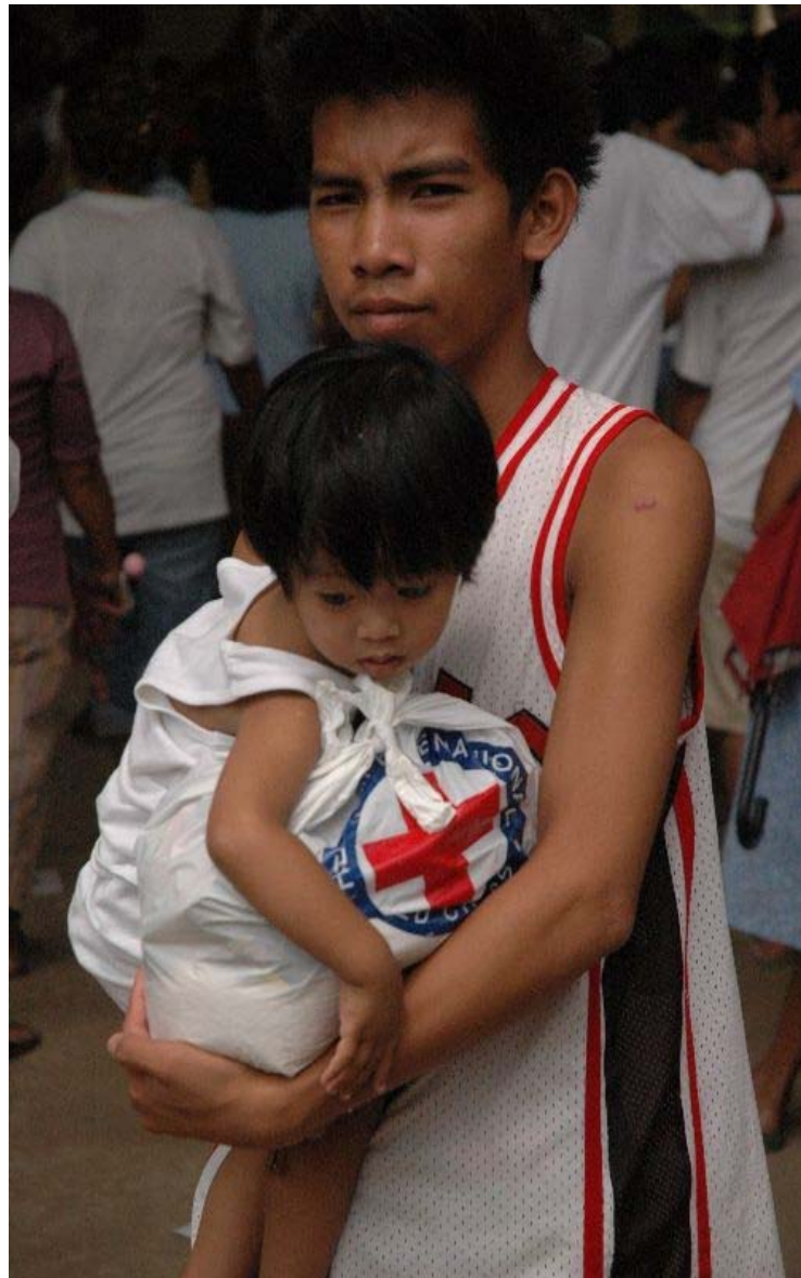
A beneficiary receiving some food items from the Philippine National Red Cross relief operations in Metro Manila.

Daily coordination meetings are held with all Movement partners at operational level. Similarly, there are various sectoral meetings held on a daily basis. Overall Movement coordination meetings are held once or twice a week, according to need. As outlined in the preliminary emergency appeal, international delegates have been identified and have now arrived in Manila to provide further support. In-country German and Spanish Red Cross partners are in the process of receiving more delegates to support the operation while ICRC has provided four water and habitation teams, as well as five tracing teams directly to PNRC.