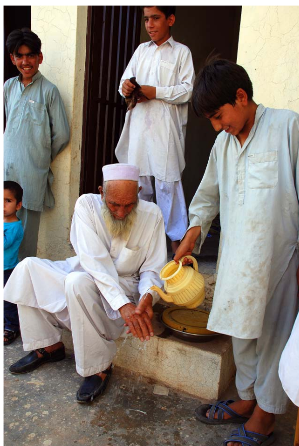
Internally displaced people from Malakand and Swat are living in cramped and squalid conditions, with as many as 30 people staying in a two-room house. Most of the affected families have only one change of clothing and are solely dependent on host families or local NGOs.

On Friday 5 June, a meeting was held in Geneva, hosted by the International Federation and the ICRC, and with representatives of the PRCS, to present the Red Cross Red Crescent Movement's response plan for this humanitarian crisis. The importance of a strong Movement coordination framework was agreed.