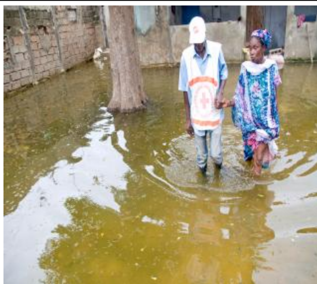
A Senegalese Red Cross volunteer assists in evacuation efforts.

In addition to the significant support of CHF 200,000 allocated from the Federation's Disaster Relief Emergency Fund (DREF) to support the National Societies in delivering assistance on a regional basis to some 3,450 displaced families (some 17,000 beneficiaries), the Federation has also been implementing a relatively new initiative in the form of an Early Warning/Early Action Emergency Appeal (no. MDR61005 launched on a preliminary basis on 10 August 2009) for CHF 918,000. The Early Warning and Early Action appeal is primarily focused on disaster preparedness, including the readiness of trained staff and volunteers, and delivering vital relief items from pre-positioned emergency stocks in the region. The Early Warning and Early Action Appeal also reflects the Federation's commitment to putting plans into action, and the effectiveness of collaborative efforts and partnerships with, among other organizations, the African