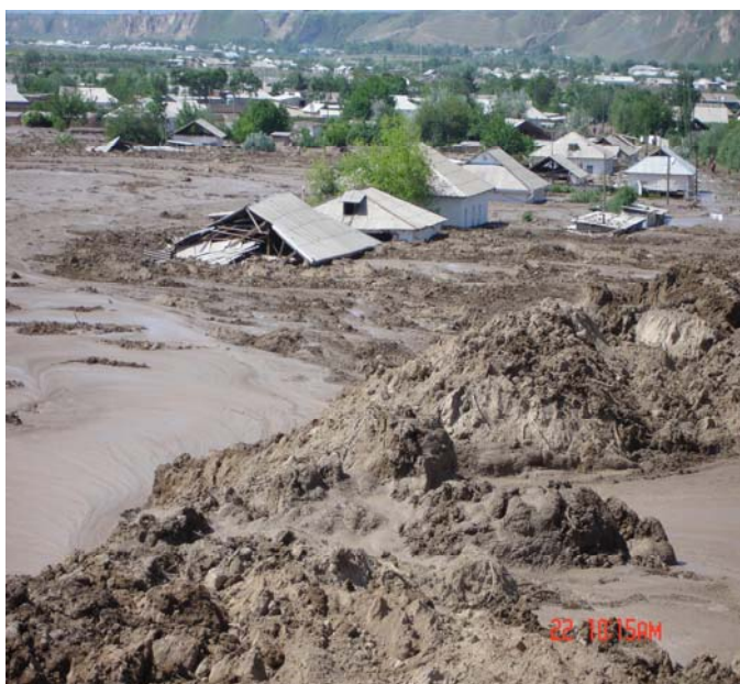
Houses buried under mudslide in jamoat Ayni, 18 th Hizb village in Khuroson district.

<click here for the DREF budget, here for contact details, or here to view the map of the affected area>