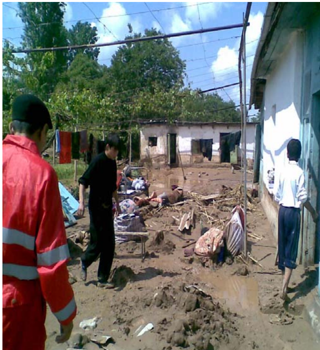
This household in Tursun-Zade district has been damaged and left without amenities and foodstock.

<click here for the DREF budget, here for contact details, or here to view the map of the affected area>