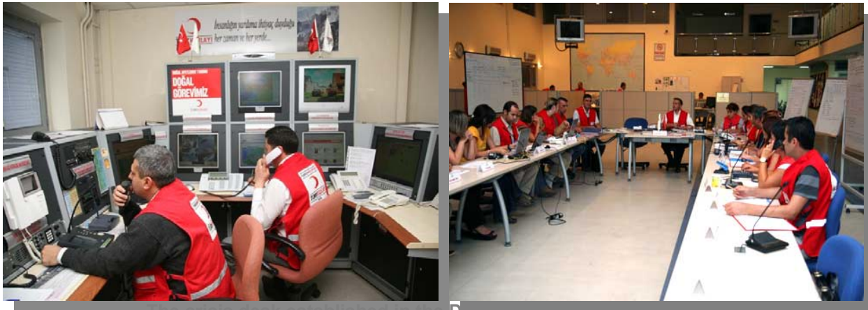
The crisis desk established in the Disaster Operation Centre (AFOM).

Taking the meteorological alerts into consideration, the Turkish Red Crescent alerted its regional and local disaster management centres on the heavy rains on 8 September in the Marmara region. As the floods were triggered by the rains, a red alert was issued by the Turkish Red Crescent which called on all branches located in the region to be ready for responding to the floods. Concurrently, the crisis desk was established in the Disaster Operation Centre (AFOM) to coordinate all response activities at national level in close coordination with the relevant authorities.