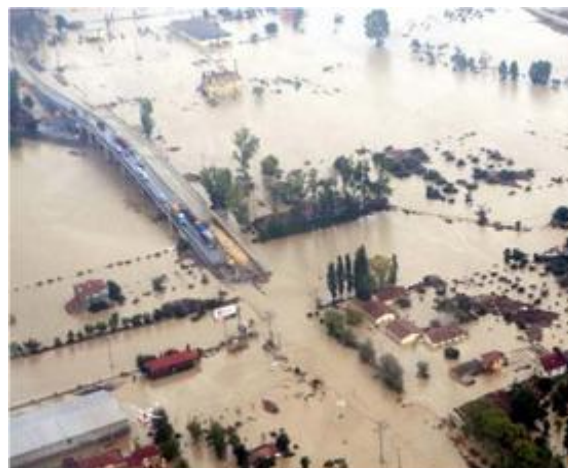
Two major highways leading to Istanbul were closed down.

The Turkish Red Crescent, with the support of the International Federation, responded to the floods, that affected 11 districts in Istanbul and Tekirdag, by providing 5,000 beneficiaries with food and hygiene items during the emergency phase, as well as 12,118 beneficiaries with psychosocial support and education tools in the rehabilitation period.