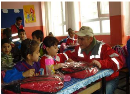
School stationery kits distribution

11,503 stationery kits were distributed to all first to fifth grade students in seven secondary schools. 2,380 Learning safe living programme student booklets and 59 teacher booklets (provided by Turkish Red Crescent education department) were distributed to fourth grade students and teachers. 497 stationery kits and 2,620 Learning safe living programme student booklets were put in stock to be distributed in another project or disaster response operation. The disaster exercises at the schools as well as trainings for muhtar (neighbourhood officials) and religious leaders are planned to be organized next year as part of the “ Project for Organizing Community Leaders ” that has been conducted in all districts of Istanbul for the last three years.