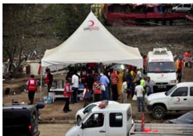
Distribution of food parcels and kitchen sets in Istanbul and Tekirdag