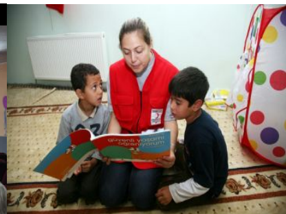
Safe living programme booklets