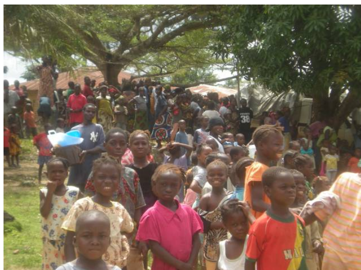
Children make up the larger percentage of the Ivorian refugees in Liberia/IFRC

This Revised Emergency Appeal now seeks CHF 3,977,698 in cash, kind, or services to support the Red Cross Societies of Côte d'Ivoire and Liberia, as well as National Societies in other neighbouring countries to assist some 13,500 families (67,500 beneficiaries) for 12 months. The operation will be completed by the end of December 2011. A midterm report will be made available after six months into the operation, and a final report submitted by the end of March 2012 (three months after the end of the operation).