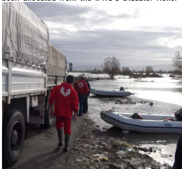
Albanian Red Cross assessing the situation caused by floods

To address the situation, the Red Cross Society of Albania with support from the International Federation will assist 2,000 families in temporary accommodation and/ or in their flooded houses with basic food and non-food items