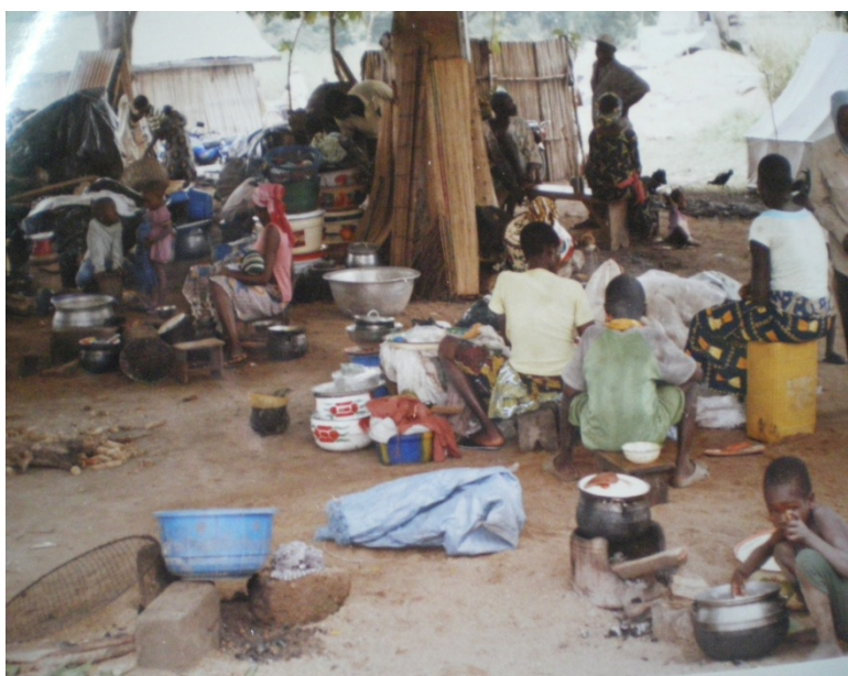
Some of the families displaced by floods: Photo: Red Cross of Benin

With support from the IFRC, the National Society envisages extending relief assistance to 10,000 target beneficiaries. The Red Cross of Benin has already mobilized its volunteers in the affected communities to carry out evacuation, First Aid, psychological support and sensitization on good hygiene practices. The National Society also provided NFIs to some 1,061 affected households, whilst flooding continues due the persistent heavy rainfall.