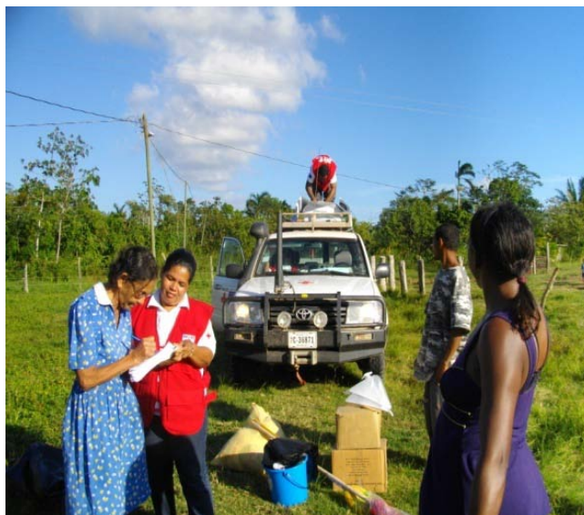
Belize Red Cross Society volunteer distributes non-food items and cleaning kits to a family affected by the floods.

This operation seeks to support the Belize Red Cross Society in providing food and non-food items to 500 beneficiary families affected by the hurricane.