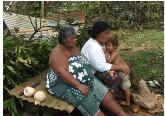
Aitutaki residents survey the remains of their home and crops.

The Cook Islands Red Cross Society staff and volunteers have been deployed to Aitutaki, which was the most badly affected island. Support to the Cook Islands Red Cross Society with regard to assessment and the operation has been provided by an Australian Red Cross water and sanitation delegate. A needs assessment has been completed, which indicates that there are 317 affected households; and the greatest needs at this time are shelter, food and access to safe water.