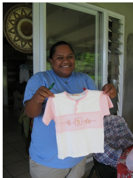
A CIRCS staff member with infant clothing for distribution on Aitutaki

CIRCS, with the assistance from New Zealand Red Cross, Australian Red Cross, the International Federation and the New Zealand Government has mobilized tents, tarpaulins, displaced families, shelter provision, hygiene kits, water containers and tents.