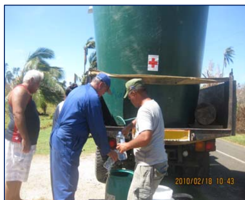
Aitutaki community receiving drinking water, treated and distributed by the Red Cross.

The national society is in the process of negotiating with the government of the Cook Islands on identifying suitable land for the Aitutaki branch office. In the interim, a container has been placed on the site used by CIRCS as the base for their response effort. The relief items, provided by the Australian Red Cross and the New Zealand Red Cross, were transferred from the stocks in Rarotonga and distributed to recipients. Following the completion of distribution(s), the replenishment of stocks is underway. All surplus stock has been packed and returned to the national office for storage and distribution to other branches in preparation for future events.