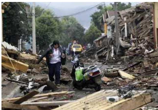
A woman walks along a street filled with debris caused by a major earthquake in Constitucion 1 March 2010.

The 8.8 magnitude earthquake which hit on 27 February resulted in a death toll of approximately 708 people and this is expected to rise. This was one of the most powerful earthquakes in decades to strike Chile causing destruction in isolated towns. Waves generated by the tsunami swept into the port town of Talcahuano in the region of Bio-Bio, causing serious damage to port facilities and lifting fishing boats out of the water. A tsunami warning was issued for more than 50 countries around Latin America and Asia and Pacific. The tsunami warnings have now been suspended.