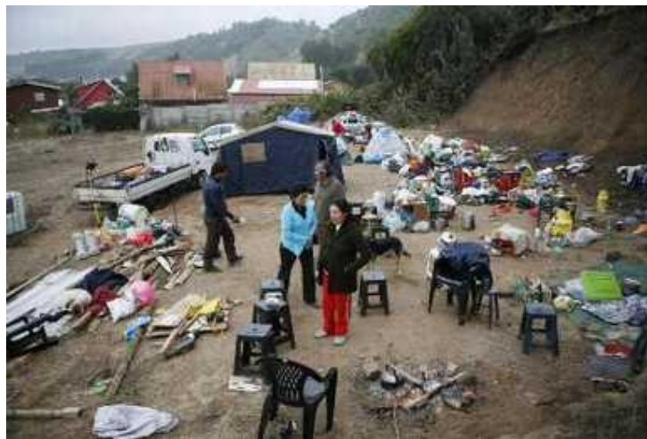
Residents set up camp away from their homes that were destroyed by the waves generated by a major earthquake in Iloca, 1 March 2010.

CHF 300,000 (USD 279,350 or EUR 204,989) was allocated from the Federation's Disaster Relief Emergency Fund (DREF) on 27 February 2010 to support the Chilean Red Cross (CRC) to initiate the response and deliver immediate relief items for 3,000 families. Un-earmarked funds to repay DREF are encouraged.