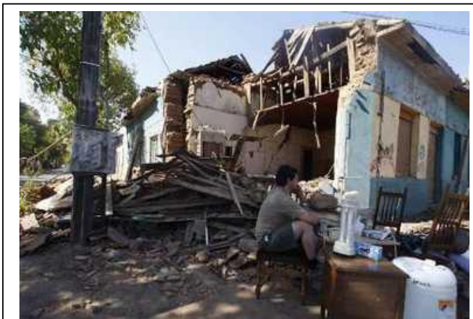
A resident sits with his belongings outside his home destroyed by a major earthquake in Talca 28 February 2010.

The airport in Concepción has been damaged but is opening again for commercial flights and is already open for cargo flights. The Santiago airport remains closed due to damages in the terminal building. The Civil Aeronautics Direction of Chile is studying the best approach to open emergency installations in the next 48 hours to receive national and international flights.