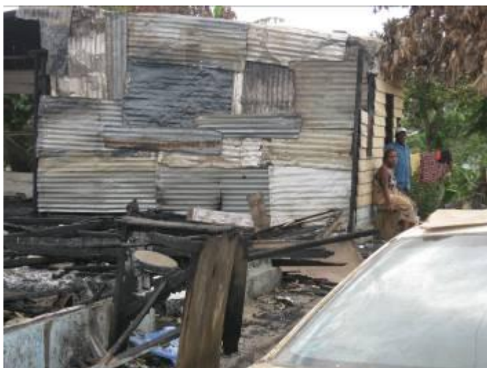
Fire completely destroyed many houses like this one in Camaremi and Alcaide neighbourhoods of Malabo, and families have been left homeless

Summary: Serious fire first occurred in the Camaremi neighbourhood of Malabo in the night of 12 to 13 April, 2010. As the populations were still struggling to manage the consequences, another fire occurred in the night of 14 to 15 April, 2010 in the Alcaide neighbourhood, still in Malabo, the capital of Equatorial Guinea. Fifty families, i.e. 250 people, have been left homeless and deprived of all their belongings. The volunteers of the