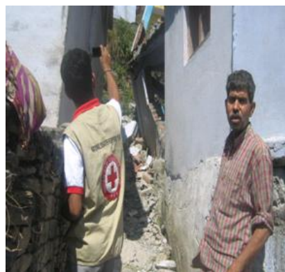
National disaster response team member assessing damaged houses during rapid assessment in Uttarkhand.

The assessment team deployed in Uttarakhand initially planned to visit the Haridwar and Uttarkashi districts. However, due to landslides, the team could not access Haridwar. The following are some findings from the Uttarakhand flood and landslide affected areas: