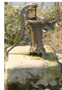
Raised deep bored hand pumps give safe drinking water. But if the pump is submerged then muddy water is being pumped up. Muddy water is not safe for consumption.