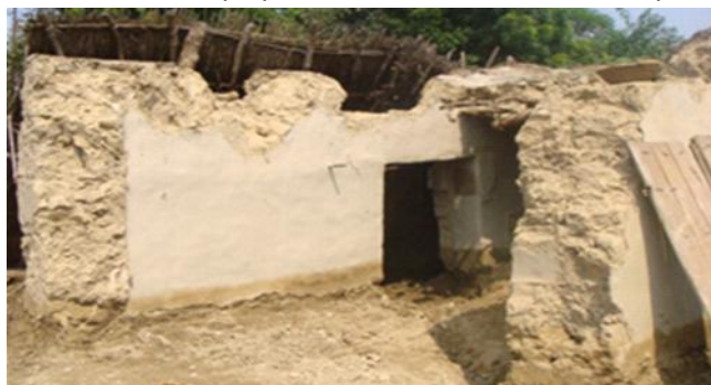
Mud houses cannot withstand gushing water and can be badly damaged.

In response to the floods in Uttar Pradesh on 5 October 2010, IRCS's NHQ deployed a team with IRCS representatives from Lucknow, the capital of Uttar Pradesh, to conduct a rapid assessment of the affected area. The team randomly visited the flood affected areas of Harpalpur, Sandi, Lamkan, Kundanpurwa, Karanpur, Sawaijpur and Magrosa in the Hardoi district. The same team also made random visits to the flood affected areas in the Lucknow district: Lahasa, Intoza, and Chandrikadevi where the situation was similar to that of the Hardoi district as the villages on the bank of Gomati River.