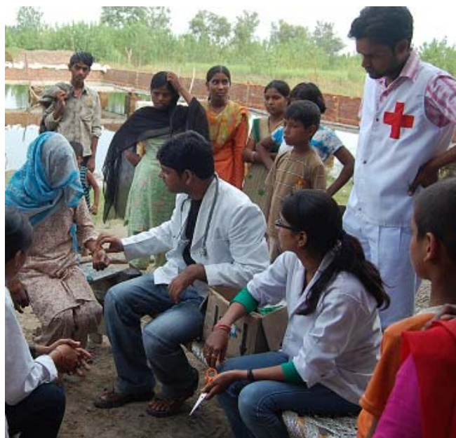
Medical check-up camp conducted by the Haridware district branch.