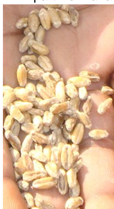
Recovered grain is not consumable.

Apart from analyzing the situation, affected people were also interviewed for any particular disease like typhoid, jaundice, gastro enteritis, malaria and so on. People reached were also asked if they are receiving proper treatment on time for such diseases. In affected areas nothing abnormal was reported except the few cases of high fever, skin infections and eye flue.