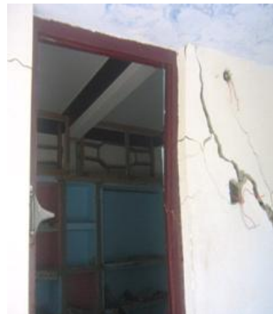
Pakka houses made of gravel and cement and supported with simple bricks tend to be easily washed out and damaged.

1. Shelter: In most of the affected areas, there are pakka houses. Thousands of such houses have been damaged and washed out fully or have collapsed partially. Mud and big boulders have spread everywhere due to the landslides. Fissures and cracks which may result in the collapse of houses put some communities at more risk. People are forced to leave their unsafe houses and look for alternative shelter. The government is planning to shift people to new sites. IRCS has been requested to provide tents and tarpaulins for temporary shelter to affected people at new sites.