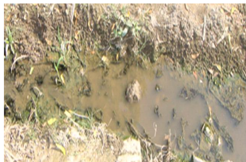
As the flood recedes stagnant water pockets remain in nearby fields and houses. These could be breeding grounds for mosquitoes and have a potential to become very dangerous.

4. Health: The Chief Medical Officer mentioned that there is no alarming public health issue in the affected areas except the cases of the usual viral fever. It was also noted by the assessment team that the health facilities available are very limited compared to the needs of the population. Hygiene standards observed were very poor and IRCS is looking to play a big role in the promotion of good hygiene practices. As the flood waters recede, sludge and pockets of stagnant water remain in the nearby fields and houses. Measures are required on an urgent basis in order to ensure that no breeding grounds are left for mosquitoes.