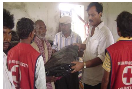
Distribution of family packs in Saharsa.