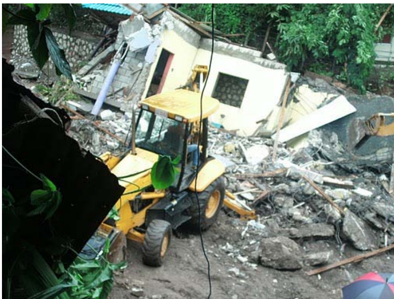
A joint damage and needs assessments carried by the Jamaica Red Cross and the Ministry of Labour and Social Security shows that at least 45 houses were destroyed during Tropical Storm Nicole.