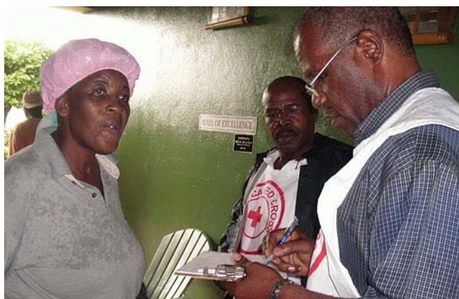
142 volunteers of the Jamaica Red Cross have been working in assessment and relief distribution.

The following table shows the relief items that were distributed by 19 November 2010: