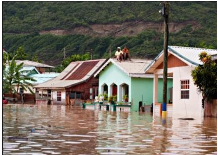
Saint Lucia has been experiencing heavy rainfall, the culmination of which has resulted in flash flooding in the Dennery Quarter.

Summary: For the past two weeks, Saint Lucia has been experiencing heavy rainfall, the culmination of which has resulted in flash flooding in the Dennery Quarter. Four hundred households have been affected and the rains are expected to increase throughout October and November. This DREF operation aims to replenish the distributed relief stocks of the Saint Lucia Red Cross and provide continuing hygiene promotion and psychosocial support to flood affected families.