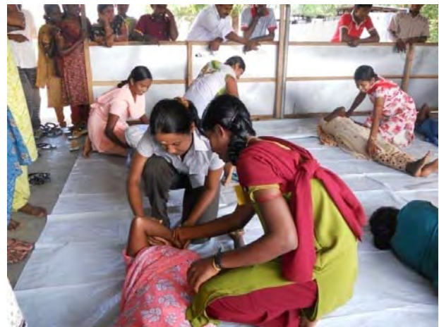
Participants practice recovery position in the First Aid training conducted in Kilinochchi.

Two three-day first aid trainings for 50 volunteers (6 men, 44 women) in Kilinochchi were conducted in December 2010. These were based on a first aid training curriculum for volunteers developed by SLRCS with special focus on mine injuries, snake bites and potential injuries related to housing construction. These volunteers are expected to disseminate first aid knowledge and skills to the resettling communities.