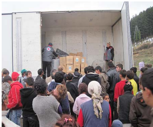
Distribution in Berane, November 11 th 2010.

Crisis headquarters were established in Berane and Plav, and Secretaries of the local Red Cross branches are members of those. Local authorities from all three municipalities in cooperation with UNHCR provided two cooked meals for all the people evacuated on a daily basis since 10 th November. The Red Cross of Montenegro and UNHCR provided emergency relief items for the evacuated population in Berane. Local Red Cross disaster teams are in the field to monitor the situation and to coordinate Red Cross activities with other partners.