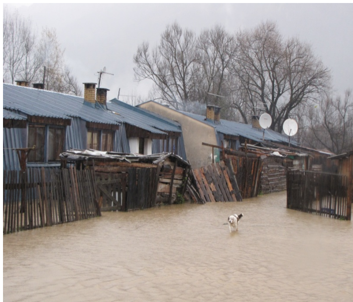
Plav, November 10 th 2010.

Summary: Heavy rains over the past four days caused floods in central and northern parts of Montenegro, causing severe damage, especially in three municipalities up north. 270 families were evacuated (around 1350 persons), and are in need of basic emergency relief items. The Red Cross of Montenegro has already assisted the evacuated population with some of these items, and plans to continue with the distribution, according to the development of the situation in the field.