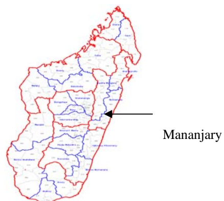
Figure 1: Areas affected by Chikungunya