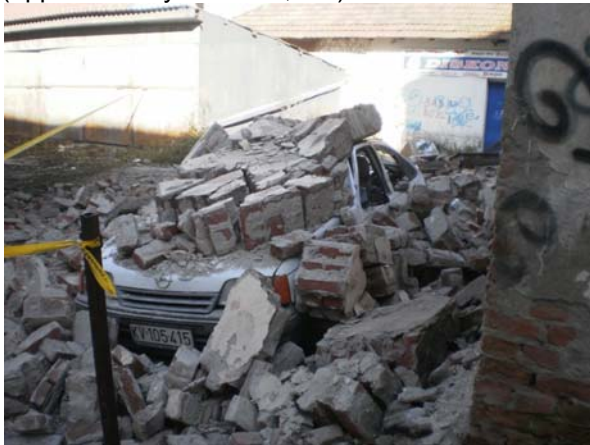
Devastation in Kraljevo.

The Serbian government announced the immediate assistance in the amount of RSD 6 million (approximately EUR 55,000) for the town. The area was visited by the President, the Prime Minister and