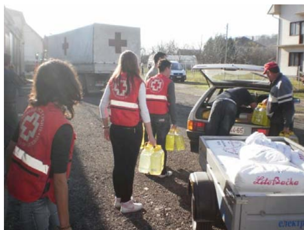
Relief distribution in Kraljevo.

The initial safety assessment and the subsequent damage assessment will be taking some time since many houses suffered damages and there is a need for qualified expert's checks. So far the teams are only responding when asked by the owners to come and examine the house due to the limited capacity.