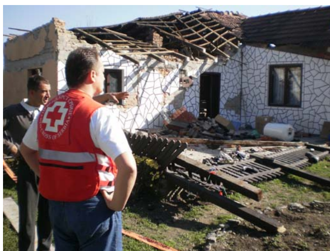
Red Cross of Serbia Assessment Team in Sirča village, Kraljevo Municipality.

This operation is expected to be implemented over three months, and will therefore be completed by 31 January 2011; a Final Report will be made available three months after the end of the operation (by 30 April 2011).