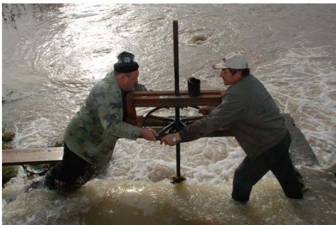
Fighting the floods in Ljubovija.

Prijepolje was without drinking water between 2 nd and 3 rd December with some 100 people evacuated but at the moment safe water is available in all of the affected communities, through distribution of mobile water in some of the villages. A bridge was destroyed in Brodarevo, municipality of Prijepolje by water. In Bogatić, the high level of subterranean water is affecting more than 150 acres of farmland as well. Electricity supply is regular in most of the communities after the first two days where there were shortages.