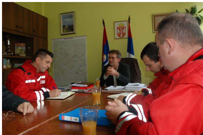
Assessment in Ljubovija.

At the moment, according to the Red Cross of Serbia assessment in all the affected municipalities, some of the immediate needs of the evacuated population in terms of food and hygiene have been met through the emergency stock disbursement; however the needs still persist and will be met through subsequent distribution. The Red Cross of Serbia will assist with water/ mud removal and with dehumidification and disinfection of households as soon as the water has receded. It is estimated that for this activity the operational timeframe will be up to three months after the water has receded, including another round of distribution of hygiene parcels.