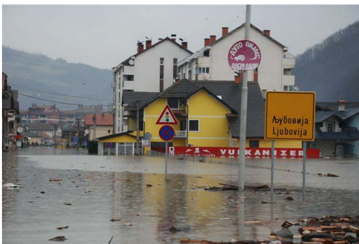
Ljubovija under water.

Summary: Due to the heavy rain in Montenegro, Bosnia and Herzegovina/ Republic of Srpska, the water level in rivers Drina and Lim has been on a steady increase since 1 December until 3 rd December, with water spilling out of the river beds and flooding the houses, buildings and agricultural land in five municipalities in the western Serbia. 3000 people were evacuated between 1 st and 3 rd December and approximately 720 houses are under water at the moment. The levels of Drina and Lim rivers have been receding since 4 th December, however the river Sava's water level is on the rise further endangering several municipalities along its bank, including the capitol, Belgrade. The Red Cross of Serbia has reacted immediately, doing rapid assessment of needs in the five affected municipalities and distributing food and non food items to affected and evacuated people from 960 households. This DREF operation will include replenishment of emergency stocks of the Red Cross of Serbia, another distribution of hygiene parcels and assistance with water draining, mud removal and dehumidifying of living facilities for approximately 4000 people. The operation is expected to be implemented over four months and will be therefore completed by the end of March 2011. A final report will be available by the end of June 2011 (three months after the end of operation).