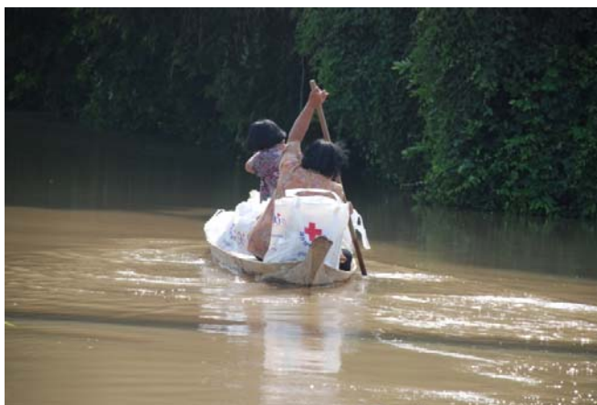
Singburi/Thailand, October 2010: People affected by the floods in central Thailand row back home after receiving relief kits distributed by Thai Red Cross.

Some 30 provinces covering 217 districts, 1,486 sub-districts, and 10,554 villages, causing 1,010,193 households (3,153,016 people) to be affected. The number of casualties has increased to 181 and expected damaged farmland stands at 6,316,156 rai (2,526,462 acres) according to the report from the Department of Disaster Prevention and Mitigation (DDPM) on 9 November 2010.