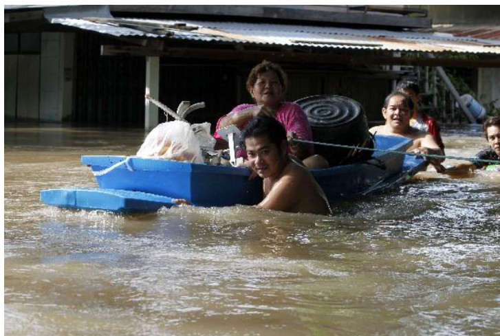
Severe monsoon floods have struck Thailand since August 2010. Presently 30 provinces have been affected, prompting the call for assistance across the Red Cross Red Crescent Movement.

This operation is expected to be implemented over two months, and will therefore be completed by 25