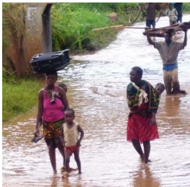
Families affected by floods evacuate to safer grounds.

There is widespread destruction of infrastructure including damaged roads. A significant number of water wells which serve as the major sources of water for family use have been contaminated and thus rendering thousands of families without clean and safe water. Destruction of crops and pasture land has also been noted in all the affected communities. Majority of the affected persons are currently accommodated in makeshift structures and in some public schools.