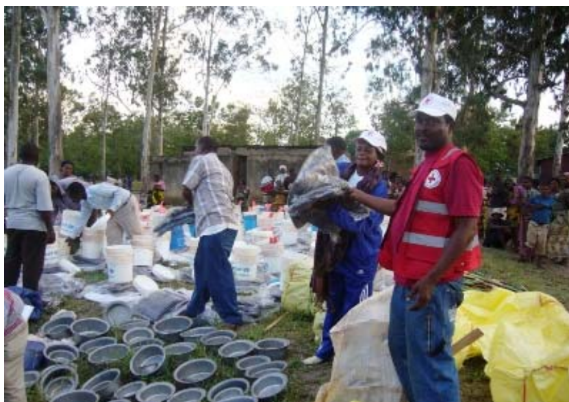
TRCNS volunteers distributing non-food items to families affected by Floods.

TRCNS Headquarters through its respective local branches in the affected areas is closely working together with the local government and collaborating with other agencies such as United Nations Children's Fund (UNICEF) in supporting affected community and maintaining contacts and updates to International Federation Regional Office in Nairobi.