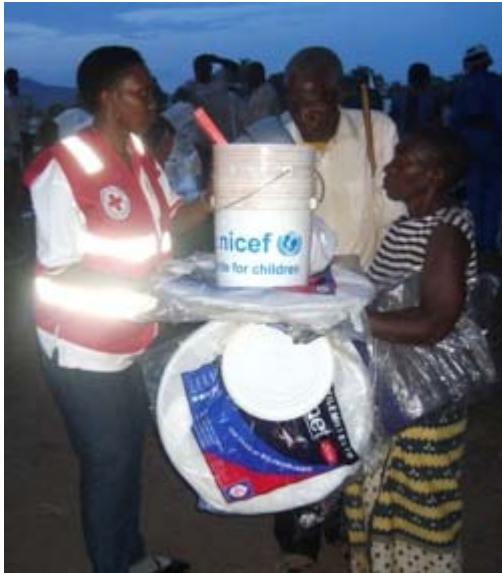
Family affected by floods receives non-Food items from TRCNS volunteer.