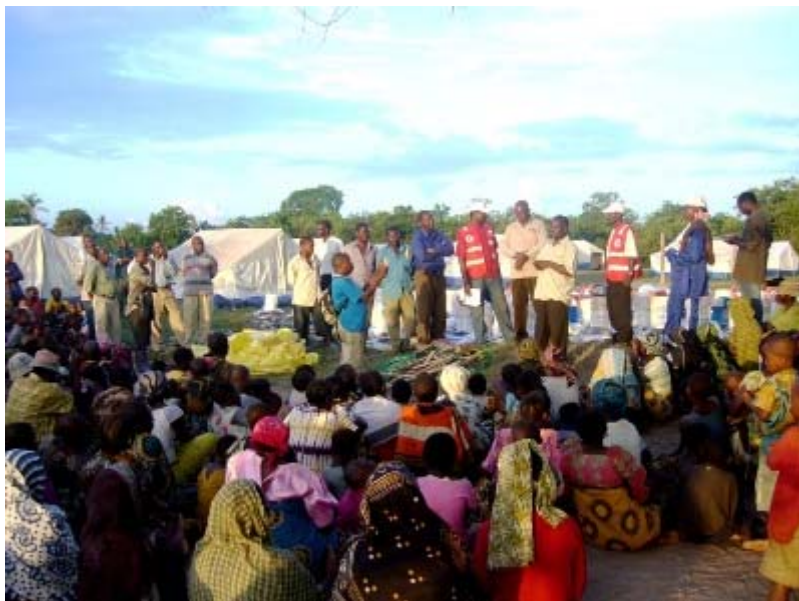
Families affected by floods awaiting for support from TRCNS and other partners.

As a result of the flash floods, many families were forced out of their homes and lost most households belongings. Replacement of basic household items and emergency shelter remain the greatest need at the moment. In addition, water sources have been contaminated and populations remain vulnerable to water borne diseases and other health hazards. In fact, cases of water borne diseases are increasing and require urgent attention to save lives and reduce further spread of AWD. Household water treatment as well as long term rehabilitation of community wells is needed.