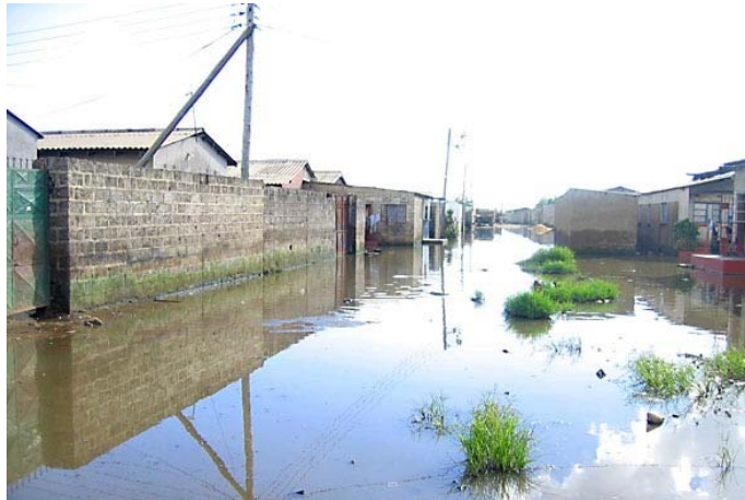
A flooded street in Lusaka

Summary: Lusaka city has been experiencing extensive rainfall over the last two months, which has flooded many highly populated suburbs around Lusaka. According to ZRCS, 120 families have been relocated from flooded slums in Misisi, Frank, Jack, Chawama, Kuku and John Howard in the capital city to temporal shelters erected near the Independence Stadium.