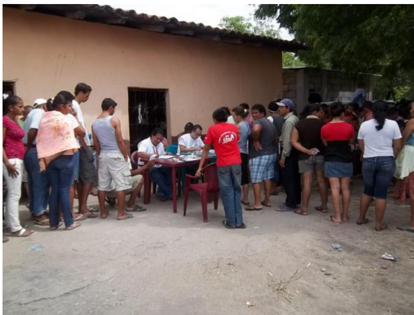
The Honduran Red Cross (HRC) registering affected families in the community of Playa Grande, municipality of Nacaome, where 185 families will be assisted.

After the severe rains in October that prompted the declaration of a State of Emergency in the southern region of Honduras, the Honduran Red Cross (HRC) started the implementation of a Plan of Action to bring relief to some 5,000 families, of which 800 families will be supported by the DREF in the municipalities of Nacaome and Marcovia. The National Society has worked