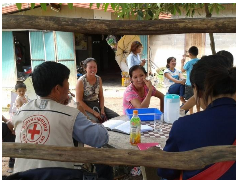
Selection of beneficiaries in Borikhamxay province by members of Lao Red Cross, national disaster response team (NDRT) and regional disaster response team (RDRT).

People to be reached have been identified, and work is now underway with communities to prepare for distributions in early September. LRC national disaster response teams (NDRTs) have been supporting branches in sharing distribution plans and in liaising closely with district authorities and community leaders.