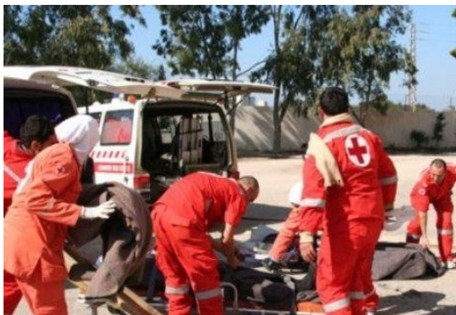
Syrian displaced people assisted by Lebanese RC volunteers.

Summary: CHF 36,849 was allocated from the Federation's Disaster Relief Emergency Fund (DREF) on 26 May, 2011 to support the Lebanese Red Cross Society in delivering assistance to some 1500 beneficiaries who crossed the border from Syria. Within the reporting period, the Emergency Medical Services of the Lebanese Red Cross (LRC) has provided first aid and ambulances services to the Syrian displaced in need for emergency medical assistance.