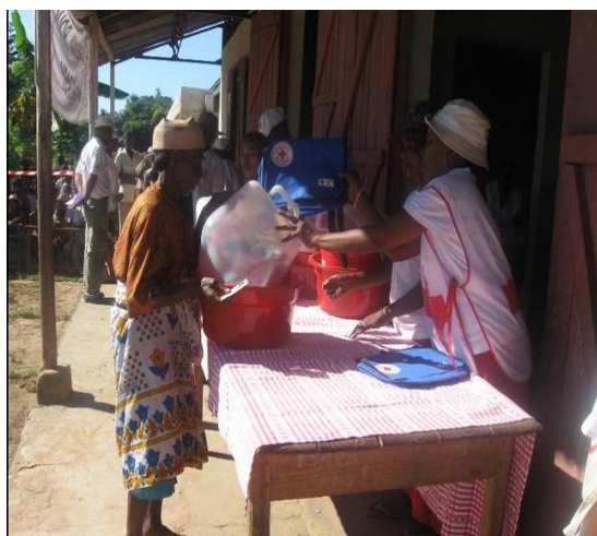
A woman receiving NFIs after the cyclone and subsequent floods destroyed her house.

28 April 2011. This ensured that the affected families received immediate assistance necessary to alleviate their suffering. The volunteers also rehabilitated wells, treated water from wells and other sources as well as trucked treated water to ensure that the affected households had adequate access to safe drinking water.