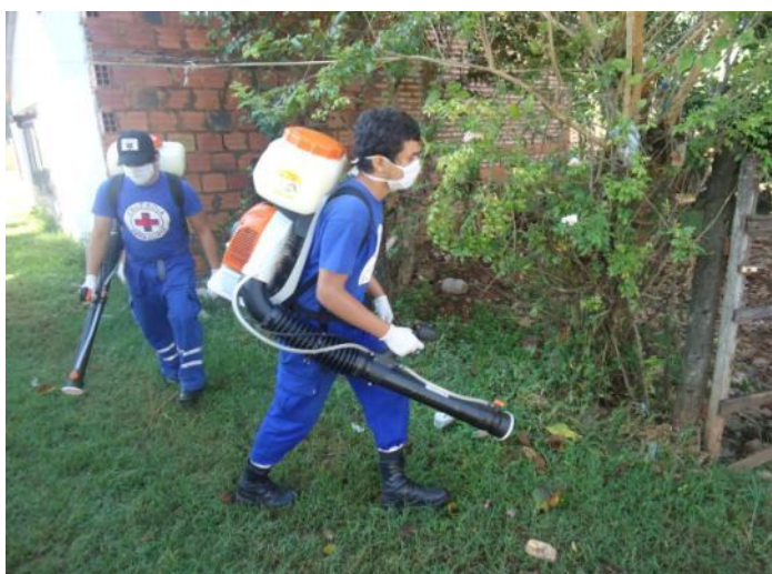
Volunteers of the Paraguayan Red Cross (PRC) visited homes and empty lots to support the government's cleaning and fumigation campaigns.

The DREF-supported operation was completed through the work of 133 volunteers (60 women and 73 men) from five sub-branches of the Central branch, and the Concepción and Alto Paraná branches. The PRC successfully reached 60 neighbourhoods from 9 districts, a population of approximately 19,455 persons through a preventive health campaign that included house-to-house visits, talks in educational institutions and distribution of informative materials in public spaces. Furthermore, a media campaign was completed, reaching an estimated 1,047,452 persons with radio and television spots.