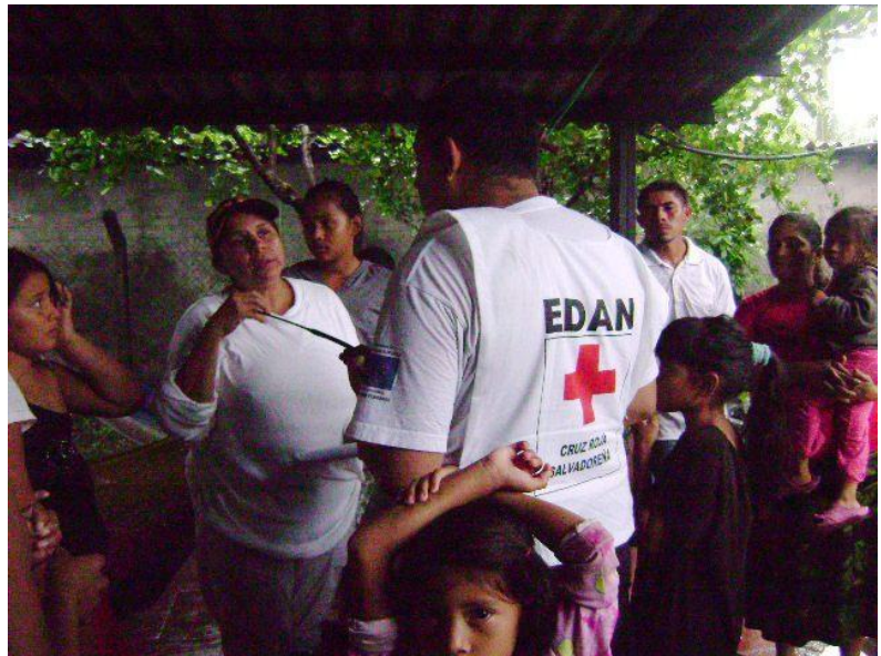
Volunteers of the Salvadoran Red Cross Society (SRCS) have carried out assessments in 127 communities.