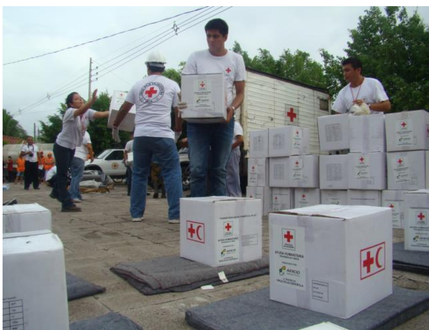
As early as 11 October, volunteers of the Salvadoran Red Cross Society (SRCS) started to distribute relief items to affected families in Ahuachapán.

On 10 October El Salvador, alongside several other countries in Central America, started to experience the effects of Tropical Depression 12-E which brought almost 1,500mm of rain, surpassing the levels reached by Hurricane Mitch in 1998. With some 300,000 persons affected by flooding and landslides, the government of