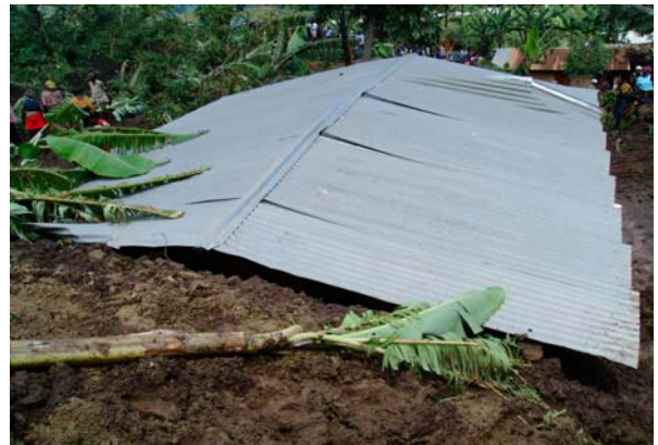
A house completely buried by the land slide in Buluganya Bulambuli District.

In Bulambuli, the assessment has established that 8,465 households have been affected directly and require assistance because they have lost property (including houses and crops) and are no longer able to live in their original areas as a result of the destruction. Of these, approximately 500 people (100 households) have been clustered in Kibanda trading centre, which has become overcrowded. The lack of access to safe water and sanitation will increase the risk of water-borne diseases and acute respiratory infections. It is also likely that more people will be joining this centre as rains continue and therefore increase the pressure on the few resources in the centre from the expanding population. In such crowded conditions, the lack of sanitation facilities means that hazardous water can breed disease. The rest of the affected population are living in churches, schools as well as with host families.