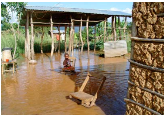
A child instructed by parents to remain seated while they attempt to save some property in the house in Bulambuli District.

the rains continue in the country, it is likely that the number of people in need will dramatically increase within a very short period of time. So far, 4 deaths have been recorded in other districts bring the total deaths to 31.