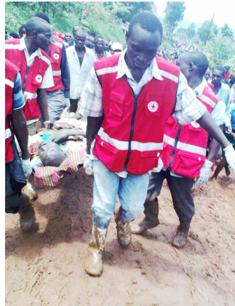
URCS volunteers responding to the landslide disaster in Maboro parish Bulambuli district. URCS

Summary: Heavy rains during the month of July in some parts of Uganda have resulted into serious flooding, landslides and water logging causing massive death and damage to property and crops. Bulambuli District has been the most affected area, with rains causing massive landslides that have resulted in the deaths of 27 people. Scores of others remain unaccounted for and are feared dead under the rubble. As the rains continue, there are fears of further damage to lives and property in many parts of the country. So far, URCS has established that over 12,615 households have been affected in 12 districts in Uganda. In many of these districts, the affected communities have been unable to cope with the impact of these disasters and therefore need assistance from government and other stakeholders to alleviate suffering. URCS is in a unique position to supplement the efforts that are now being coordinated by the Government's Ministry of Disaster Preparedness and Response through the Office of the Prime Minister. Thus, with support from DREF, Uganda Red Cross seeks to support 1,000 most-vulnerable households (approximately 5,000 people) affected by the floods and landslides. The National Society could provide non-food items, conduct hygiene promotion, search and rescue, information and data gathering (assessments) and food distribution in the affected areas.