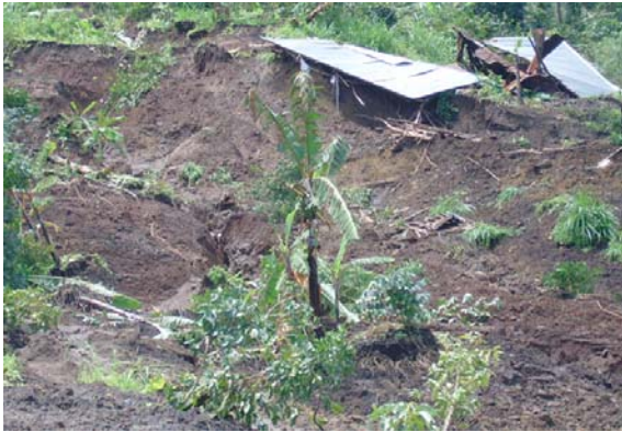
The destruction in Mabono. URCS

Following heavy rainfall that has been going on since late July 2011, the Government of Uganda declared a Red Alert early August through the Ministry of Disaster Preparedness and Response in response to flooding in parts of the country. On 28 August 2011, a landslide hit Bulambuli District severely affecting the sub counties of Sisiyi, Lusha and Buluganya in Mount Elgon Region. According to the media sources, over 40 people have been killed by the landslides in Bulambuli District 1 . However, a rapid impact assessment that was conducted by a team of URCS staff and volunteers confirmed 27 people dead (16 in Sisiyi and 11 in Buluganya) and 33 injured. Search and rescue efforts have now been called off and all efforts are concentrated on continuing assessments and verification of the affected areas. The