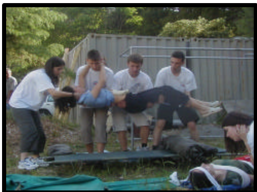
At the ready: Red Cross volunteers practice their first aid techniques.

In the area of Home Care, thirteen new municipal branches including twelve in Serbia and one in Montenegro,