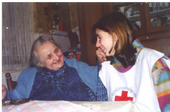
On hand: Red Cross support reaches into the community.

The government has announced some funding is available for social programmes and a number of municipal branches took the opportunity to apply for funds to operate existing programmes such as Home Care and Soup Kitchens. This is a positive step towards future sustainability and encouraging proof that an increasing number of branches is taking ownership of the programme and realises the need for developing strong bonds with the surrounding community.