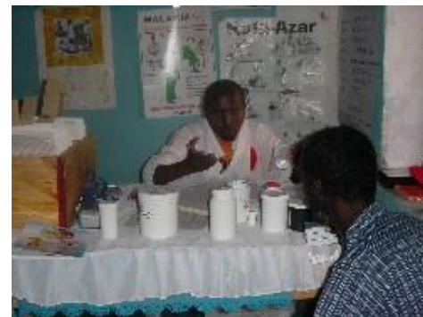
A nurse treats a patient in a Somali Red Crescent-supported MCH/OPD clinics.

The clinic staff and the community volunteers continued to provide relevant health education messages to the communities through organised lectures, discussions, demonstration and return demonstration. Topics covered included: proper environmental sanitation, importance of immunization, breast-feeding, prevention and home remedy for diarrhoea, and prevention of malnutrition.