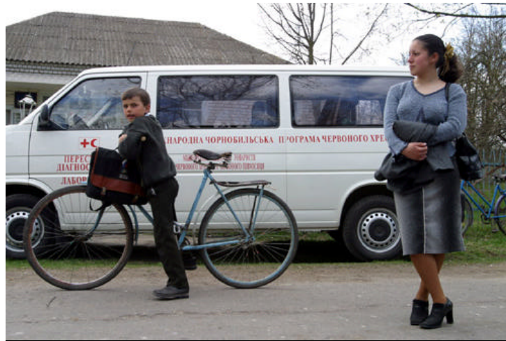
A woman waits outside the Mobile Diagnostic Laboratory in the village of Laksi, 60 km from the Chernobyl site. Red Cross doctors scan up to 70 people a day for signs of the potentially fatal thyroid cancer, which has been on the increase since the nuclear reactor exploded in 1986.