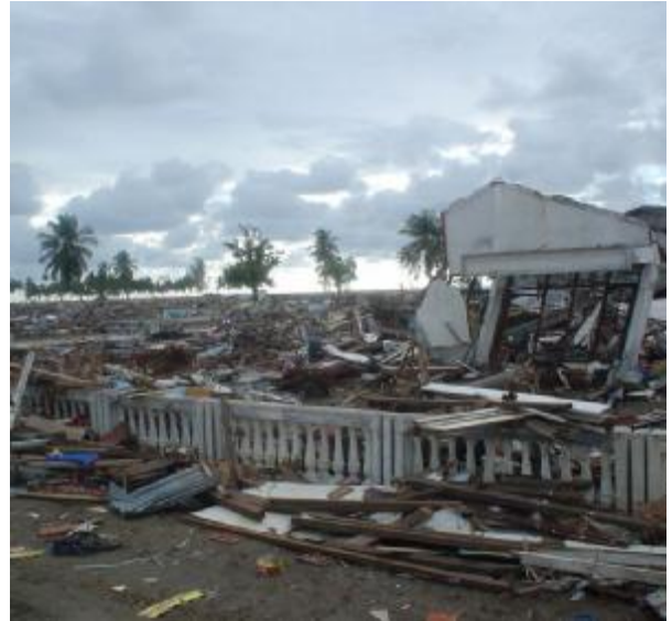
Above: The devastated town of Meulaboh, Aceh, where the International Federation is coordinating Red Cross/Red Crescent post-tsunami humanitarian assistance.

Please refer to the appeal budget below; click here to return to the title page and contact details