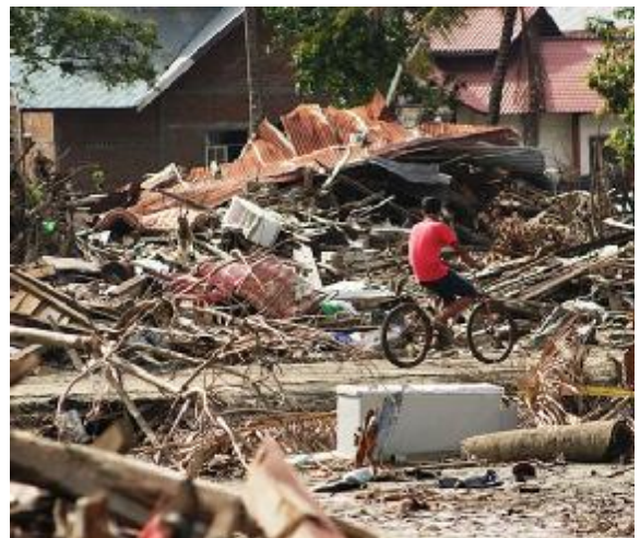
Above: Indonesia, tsunami operation, January 2005. Devastated area in Aceh province