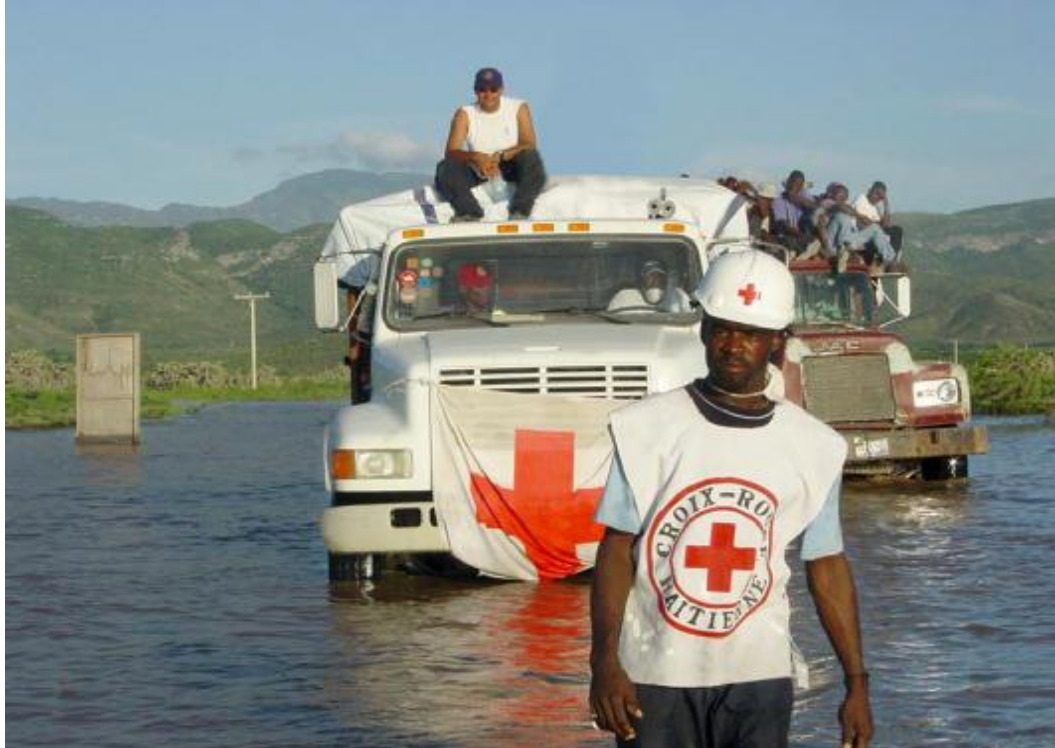
Above: Haiti, Hurricane Jeanne, September 2004. Some 200,000 people have been affected by flooding in and around Gonaïves.