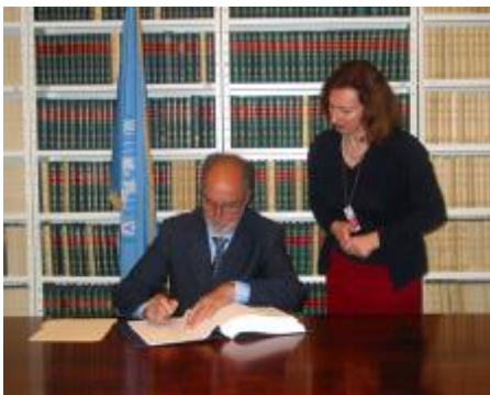
Left: Uruguay signing the Tampere Convention on the Provision of Telecommunication Resources for Disaster Mitigation and Relief Operations on May 13

The database will allow for searches by country, type of disaster, type of document and thematic IDRL item (see box). As a result, the user will have access to the relevant legal text concerning the specific information looked for.