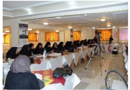
Iranian Red Cross workshop in Boroujerd (12 to 13 December 2006), aimed at increasing women's role in community-based Red Crescent activities. International Federation.

In a world of global challenges, continued poverty, inequity, and increasing vulnerability to disasters and disease, the International Federation with its global network, works to accomplish its Global Agenda, partnering with local community and civil society to prevent and alleviate human suffering from disasters, diseases and public health emergencies.