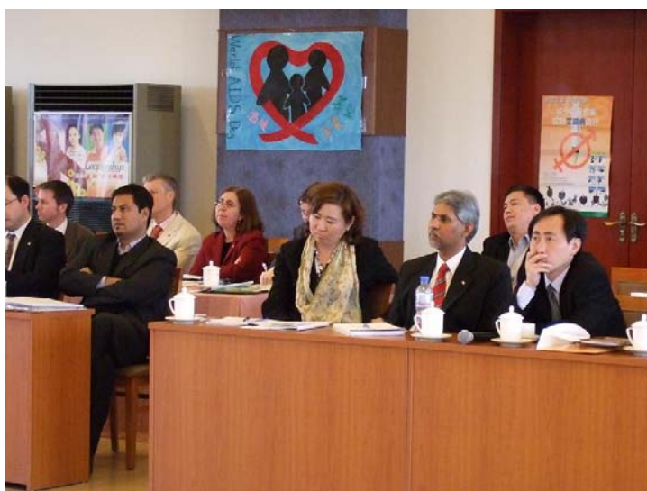
Representatives from all five national societies in the region and partner national societies of East Asia programmes gathered in Beijing, China, in early April for the annual partnership meeting.

The regional disaster management team continues to develop partnerships in the region, both between the national societies in the region, as well as with other stakeholders in the region. The regional team often meets with UN partners, as well as other those representing other NGOs and potential funding sources for the region.