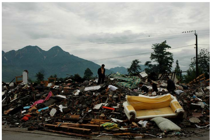
The International Federation's East Asia regional office has focused its attention on assisting the RCSC in the relief and recovery operations for the 12 May earthquake that struck south western China.

In contrast, the DPRK experienced a very dry and partly very cold winter without snow. The lack of rain and snow during the winter months has increased concerns about a potential serious food shortage. This could lead to malnutrition and thus increase the need for drug provision support from the Red Cross.