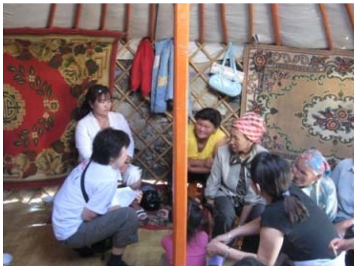
Herding families were interviewed for the MRCS avian influenza review that was held in Khovd province from June to July, 2008.

In response to the outbreak of hand, foot and mouth disease affecting almost entire country since 8 May, the MRCS has accessed the International Federation's DREF funding and launched a quick public risk communication campaign in most affected areas. This will be ongoing into the second half of the year. For more information, see the MRCS hand, foot and mouth DREF bulletin.