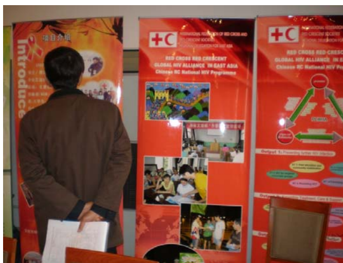
A participant at the RCSC's launch of their HIV alliance programme in March reviews posters that outline the programmes purpose and strategy.

In the first half of 2008, the major achievements included the successful launches of the HIV programmes of the RCSC and MRCS under the 's Global Alliance on HIV's framework (the first two national societies to launch an HIV alliance outside of Africa). The regional office has provided extensive support to the two national societies in preparation of these events and the regional health delegate attended the MRCS's HIV alliance launch ceremony and workshop in April. Also, on behalf of the regional office, the Australian Red Cross delegate provided in-country technical support to the MRCS HIV programme for a period of three weeks in March. The launches were widely featured in national media, and in international media in China.