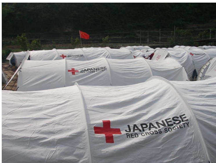
The donated tents to the Red Cross Society of China after the 12 May earthquake devastated much of Sichuan province. Malu Village, Qingchuan County, Sichuan.

This report covers the period 01/01/08 to 30/06/08