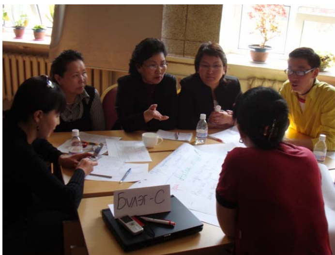
Group discussion during the vulnerability, capacity assessment training, March 2008. International Federation.

A national vulnerability, capacity assessment workshop was conducted in March 2008 supported by the regional disaster management programme. A total of around 20 MRCS staff from headquarters and branches have been trained on how to conduct vulnerability, capacity assessment in the community. The vulnerability, capacity assessment workshop focused on learning by doing, providing participants an opportunity to actively be involved in actual vulnerability, capacity assessment activities. This was a very practical way of putting their learning to use immediately, and by the end of the workshop, all the participants stated that they had the confidence to be able to conduct vulnerability, capacity assessment themselves.