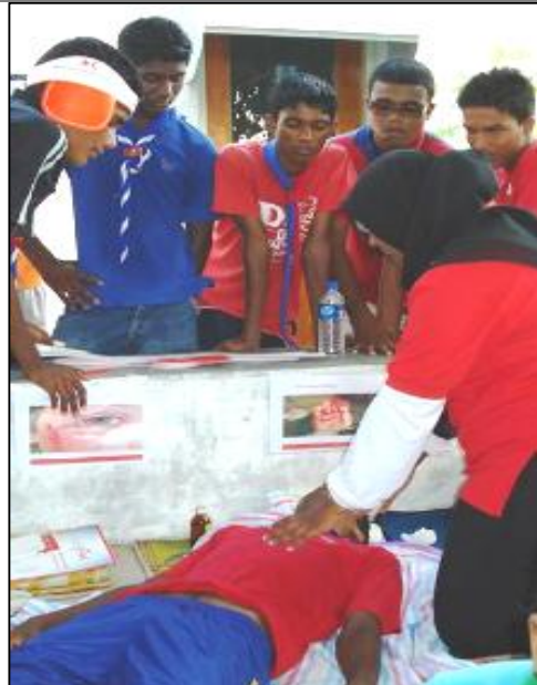
A first aid demonstration on World Red Cross Red Crescent Day in Male', Maldives.

In a world of global challenges, continued poverty, inequity, and increasing vulnerability to disasters and disease, the International Federation with its global network, works to accomplish its Global Agenda, partnering with local community and civil society to prevent and alleviate human suffering from disasters, diseases and public health emergencies.