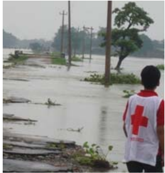
A NRCS volunteer assessing a village in flood-affected Saptari district.

In a world of global challenges, continued poverty, inequity, and increasing vulnerability to disasters and disease, the International Federation with its global network, works to accomplish its Global Agenda, partnering with local community and civil society to prevent and alleviate human suffering from disasters, diseases and public health emergencies.