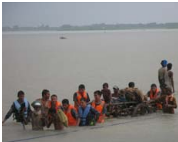
People displaced by the floods move towards safer areas in Sunsari district, Nepal

<click here for the DREF budget, here for contact details, or here to view the map of the affected area>