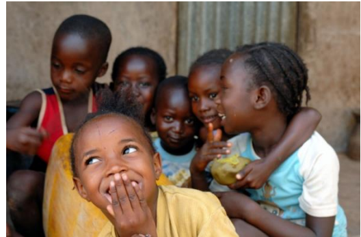
A child in the Gambia smiles during the April 2010 national polio campaign. Almost 600 Gambia Red Cross volunteers supported the campaign through house-to-house activities. International Federation

This report covers the period 1 January to 31 December 2010.