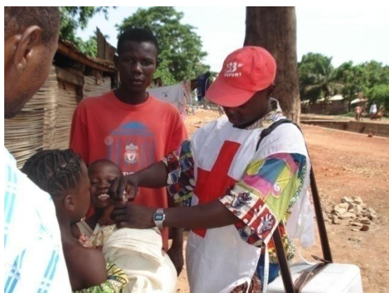
A CAR volunteer vaccinates a child against polio during the April 2010 national round.

Cameroon Red Cross received DREF funding to support the measles outbreak response activities in Langui refugee camp in March 2010.