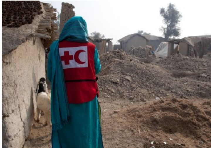
An IFRC delegate surveys flood damage in Ghalid Hussain Ghadi village in Sindh province, Pakistan.

Programme outcome: Enable National Societies, supported by the secretariat, to build disaster resilience and the safety of communities, and deliver appropriate and timely response to disasters and crises.