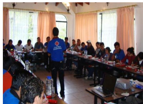
The Ecuadorian Red Cross organized a workshop on sexual and reproductive health during the first semester of 2010.

Within the Global Alliance on HIV framework, the Peruvian Red Cross continues to conduct awareness-raising activities on the topic of HIV in the PRC branches in Lima, Ica, Pucallpa, Chiclayo and Iquitos. These activities, including the printing of informative material and HIV training, have reached 140 volunteers.