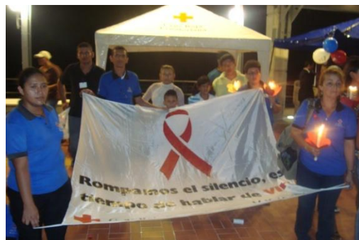
National HIV day Memorial 2010 – Ecuadorian Red Cross.

This report covers the period from 01 January 2010 to 30 June 2010