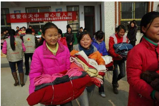
The care delivery team delivered the winter clothes to the students in Magutian township, Zhumadian on January 27 as one the warmth delivery activities before the Spring Festival.

A three-day training on voluntary service capacity building was held in April in Wuxi, Jiangsu province by the RCSC headquarters. More than 60 participants from all the 34 provincial/municipal level branches have increased their knowledge on volunteer recruitment, training, management and motivation during the practical training. This is also the first step for the RCSC to start using standard training materials on voluntary service; the Voluntary Service Training Manual was produced by RCSC headquarters with the support of the Hong Kong branch and experts from outside the Red Cross Red Crescent and published in April. The use of the standard training manual, which includes all the best practices and experiences collected from the branches, will enhance the training quality and the shared understanding on voluntary service.