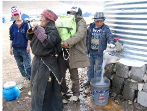
Left: Hunan water ERT is setting up water treatment equipment.