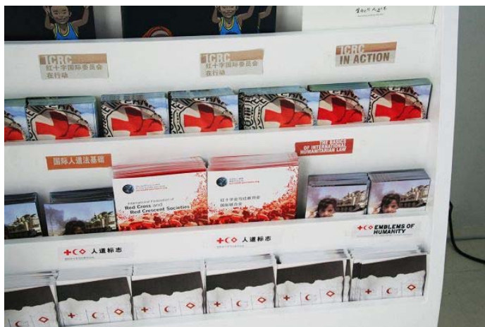
Some of the brochures produced by the IFRC in the shelves in the Red Cross and Red Crescent Pavilion for the visitors to grab.

The process entailed several trips to Shanghai, together with ICRC, to consult with the design company commissioned by RCSC to design the audio visual materials. IFRC and ICRC communications delegates reviewed the progress of work on the photographic displays and video, gave feedback and continuously fed fresh material to the designers for use in the preparation of the display.