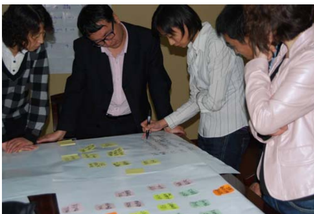
Participants are learning by active participation – making an objective tree in the programme planning and vulnerability and capacity assessment analysis workshop in Shaanxi in April.

The other major task for the regional disaster management team is to continuously support RCSC in its community preparedness and disaster risk reduction programme in Shaanxi and Gansu provinces as part of the 2008 Sichuan earthquake appeal. Following the vulnerability and capacity assessment training conducted in Shiquan county, Shaanxi in 2009, the programme formally stepped into assessment stage in the beginning of 2010. The regional disaster management team, together with representative of RCSC, conducted two field trips, on 6-9 January 2010 and 18-20 January 2010, to Shaanxi and Gansu respectively. Potential village communities were inspected and six separate meetings with provincial and county level Red Cross branches were hosted to exchange views on programme planning, budget and accountability. As these county Red Cross branches lacked basic office equipment, IFRC also supported the branches in procuring basic office facilities to support effective basic operations.