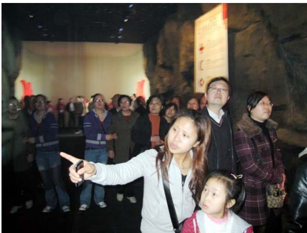
Inside the Red Cross pavilion, a mother is pointing out to her young child fact about the Red Cross Movement on the wall.

Shanghai World Expo The RCSC has taken on the responsibility of running a pavilion and of providing first-aid services to ensure a Red Cross Red Crescent Movement presence at this high-profile, prestigious event. The Expo provides the Movement with a valuable platform to highlight some major social and humanitarian issues that it faces and responds to. In particular, the theme of the Expo, "Better city, better life," fits perfectly with the Movement's focus on issues relating to urbanization, this year's World Red Cross and Red Crescent Day theme.