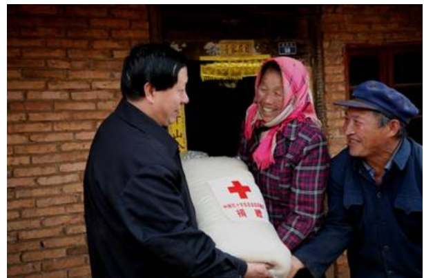
Yunnan branch of the RCSC distributing rice to the drought affected villagers. Below, water as a key relief item is ready to be distributed.

Drought Since autumn last year, five provinces in southwest China including Yunnan, Sichuan and Guizhou provinces, Guangxi Zhuang Autonomous Region and Chongqing Municipality experienced a severe drought, which has been recorded as the worst in a century for some of the affected areas. The severe drought affected over 60 million people, including 20 million people and more than 11 million livestock with drinking water shortages. Approximately five million hectares of farmland were affected and over 1.1 million hectares would yield no harvest 3 as of 23 March. Some of the once-a-century drought affected regions have been eased by rainfall in April and May, but eight million people in Yunnan and Guizhou are still facing drinking water shortages 4 as of the middle of May.