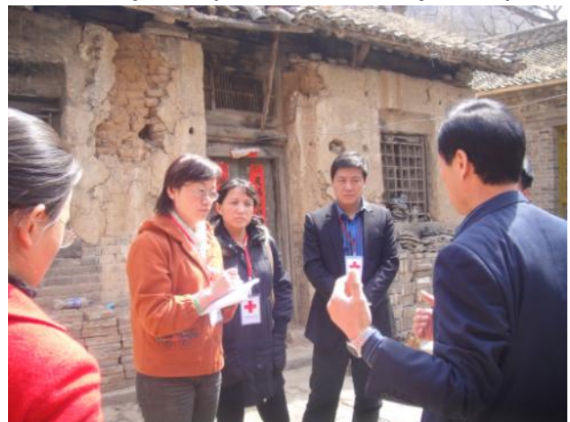
IFRC and RCSC conducted a joint tuberculosis fact survey with local branch staff in Changzhi prefecture, Shanxi city in March 2010.

The regional programme coordinator delivered a two-day planning, monitoring, evaluation and reporting training to the programme management office and disaster management and first aid department of the RCSC headquarters in May. A total of 12 people participated the workshop. The workshop was a hands on approach in four half-day sessions to enable participants who are also staff of the headquarters to apply the daily learnings directly to their current projects, while also catching up with their daily workload instead of losing two full working days. The workshop also aims to build up the planning, monitoring, evaluation and reporting capacity based on adapting tools and knowledge to the current projects of the participants. According to the end-evaluations, the participants felt that the workshop was quite helpful in its combination of discussion of current practical challenges to the learning of new methodologies and tools and making improvements on site on their current working plans.