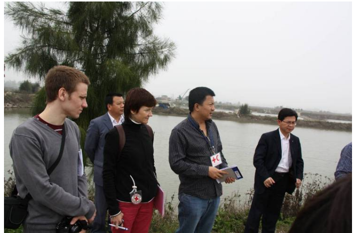
IFRC with Finnish Red Cross in one of the village in Fujian during the joint inspection trip for a disaster risk reduction and climate change reduction initiative in March.

Another community-based disaster preparedness initiative supported by Finnish Red Cross was confirmed during the reporting period. The regional disaster management team facilitated several discussions between the RCSC and the Finnish Red Cross for the disaster risk reduction and climate change adaptation project. Also a joint field visit participated by the regional disaster management team, the RCSC project management office, the Finnish Red Cross and the Red Cross Red Crescent climate change centre was conducted in Zhangpu county, Zhangzhou prefecture in Fujian in March.