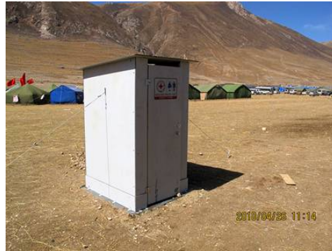
Left: Yunnan sanitation ERT is checking the set-up latrine.