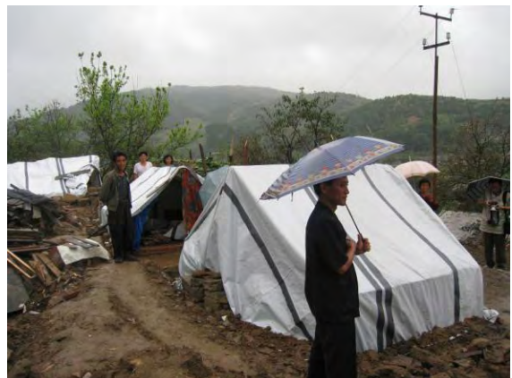
Almost 3,000 families lost their houses due to heavy rains and landslides caused by tropical storm Kompasu early September 2010, such as here in Wonsan city, Kangwon province, on the east coast of the country. People lived in makeshift shelters of plastic sheeting provided by DPRK Red Cross, distributed as part of its emergency kits.

In total, over 50 community-based disaster preparedness committees were trained and established over the past years to consolidate the National Society's role in the field of disaster mitigation and preparedness. Specific mitigation activities based on vulnerability and capacity assessments (VCAs) were carried out. Another 50 communities have been replicating the community-based disaster preparedness activities with limited material support from DPRK Red Cross. More than 20,000 volunteers have been trained in community-based disaster management and first aid. DPRK Red Cross has trained 25,000 volunteers on general disaster management, and organizes refresher