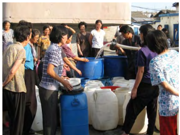
DPRK Red Cross mobilized two EMWAT mobile water purification units to Sinuiju city, North Phyongan province, when the water supply system was damaged by severe floods in August 2010. As of 12 September, over three million litres of water was produced, supplying over 30,000 families with clean drinking water.

Up to 100 Red Cross volunteers will be trained on how to operate Red Cross emergency water and sanitation response equipment. Consumables required by the emergency response equipment such as chlorine and aluminium sulphate will be supplemented or replaced to ensure they remain viable.