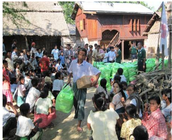
Flood-affected communities in Magway Region receive MRCS relief packages.

While MRCS planned to upgrade seven warehouses in 2011, only three were selected for upgrading in 2011 as the society's ownership of the remaining four warehouses needs to be confirmed. The upgrading works are in progress and scheduled for completion by the end of the year.