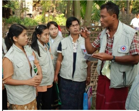
Training for branch communicators underway in Sittwe township in Rakhine State, in November.