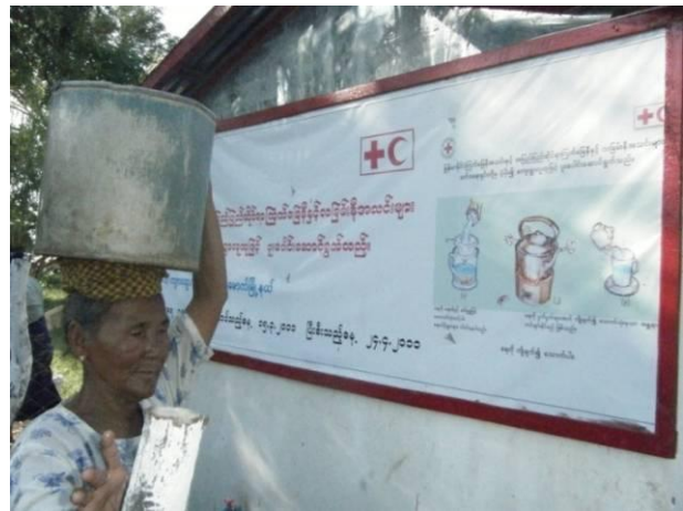
A villager collects water from a well in Pa Kyar Htoo village in Natmawk township.