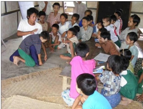
During a school-based health education session, children learn about life-saving measures to be taken during a choking incident.

Two project staff participated in a PMER workshop and financial management training from 17 to 20 November and also participated in the CBHFA facilitators workshop from 21 to 28 November. Both events were conducted at the society's headquarters in Nay Pyi Taw, and were aimed at increasing the understanding of the CBHFA-in-action approach and to learn from experiences and lessons in other project or programme areas.