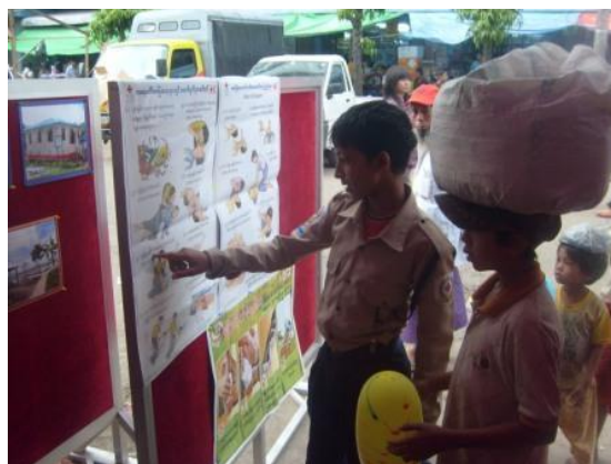
A Red Cross volunteer talks to interested youngsters about Red Cross activities on display at the MRCS booth at the Yuzana Plaza sales festival.