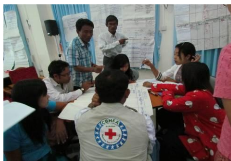
The workshop for CBHFA facilitators conducted in Nay Pyi Taw in November.