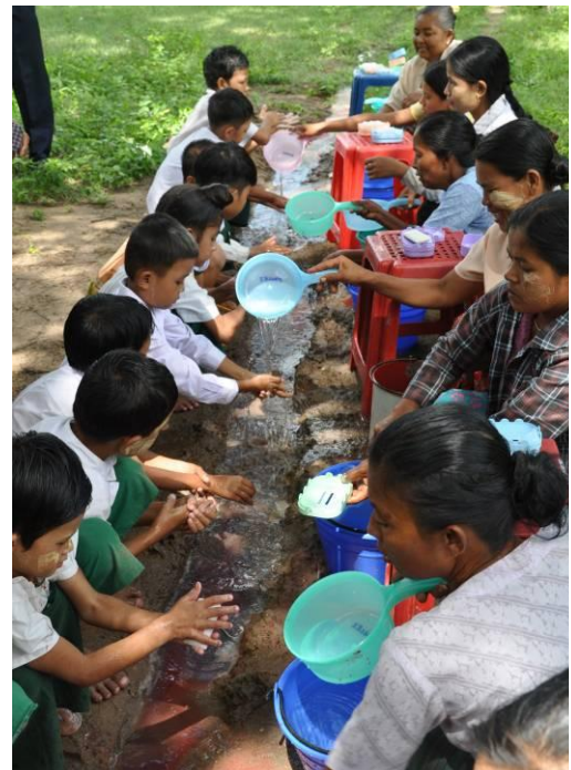
Global Hand-Washing Day was celebrated in Kyauk Tile village in Mandalay Region, where children and adults engaged in a hand stamping game in which they stamped their palms in paint to create a collage of palm prints, followed by a session of hand-washing.

Participatory hygiene and sanitation transformation (PHAST) activities undertaken by trained Red Cross volunteers and community volunteers were further enhanced with the finalization of a PHAST tool kit adapted from ICRC and UNICEF PHAST tool kits. Volunteers from both townships have been trained in the utilization of PHAST methodology. A PHAST volunteer record book has also been developed based on the CBHFA manual, and has been introduced to volunteers for the purposes of providing a report on PHAST community sessions.