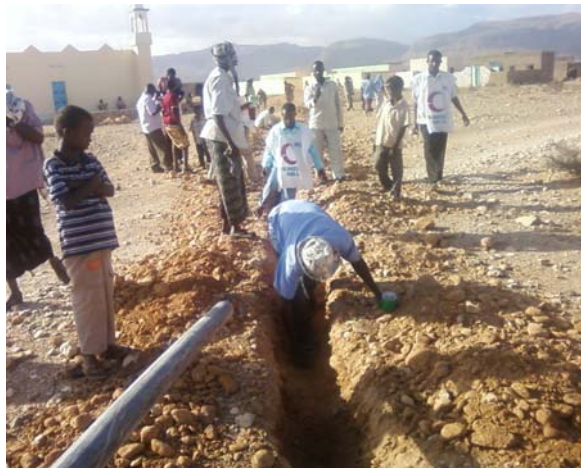
SRCS volunteers and Ufeyn village community laying PVC water pipes.