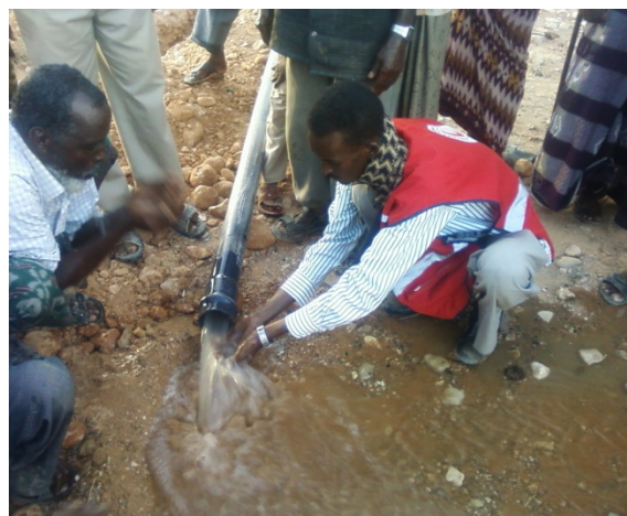
SRCS volunteers testing water pumping at Ufeyn Village, Bari Region.

This report covers the period 01/01/2011 to 30/06/2011.